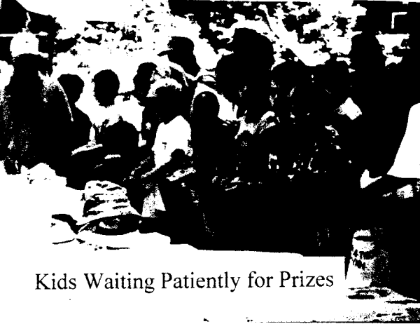
Kids Waiting Patiently for Prizes