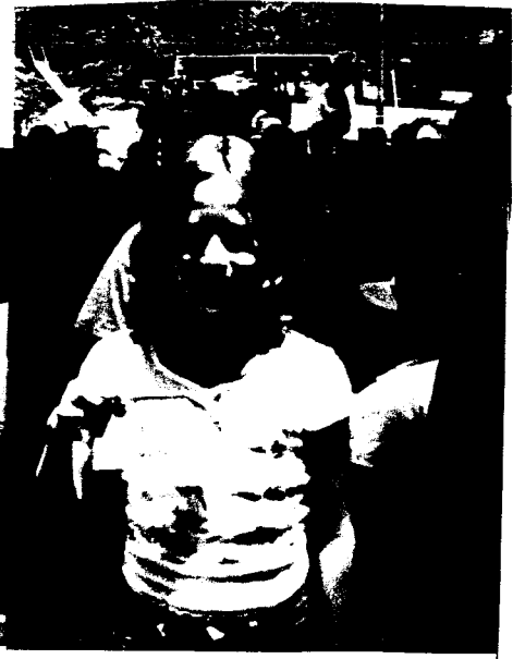
$50.00 Toy's R Us Gift Certificate Winner